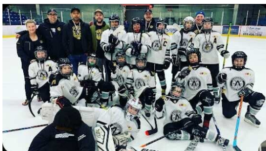
GOLD: Aldergrove U11C2