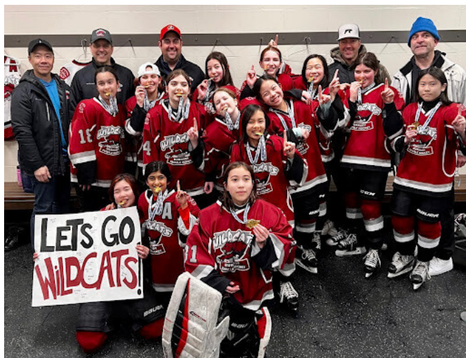
WUC1C1 wins GOLD!