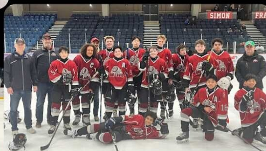
SILVER: Bulldogs U15C2