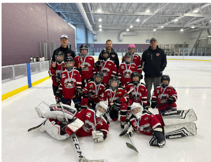
WU11C1 wins BRONZE!

To conclude the season, almost every Wildcats team competed in the Tri Cities Ice Classic which saw WU13C1 and WU18C1 take home gold; while WU11C1 and WU13A1 took home bronze.