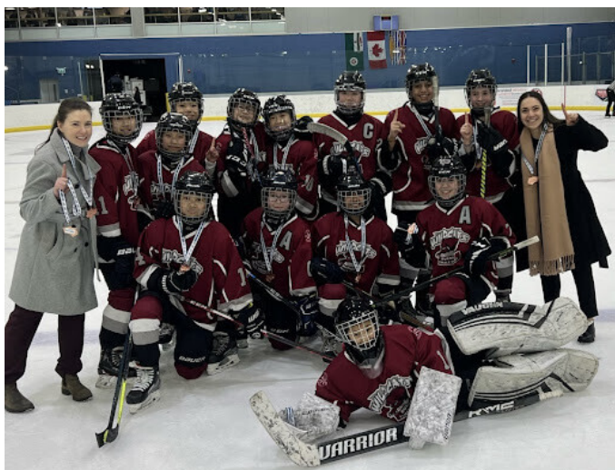
WU13A1 wins BRONZE!