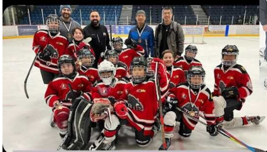
SILVER: Bulldogs U11C4