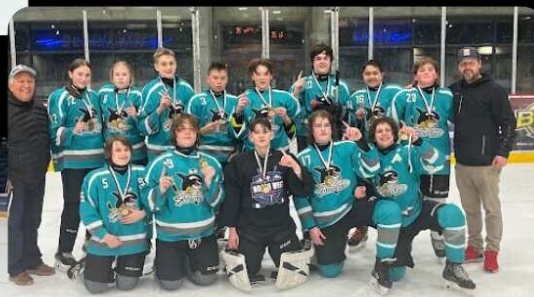
GOLD: Prince Rupert Seawolves