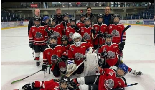
SILVER: Bulldogs U11C3