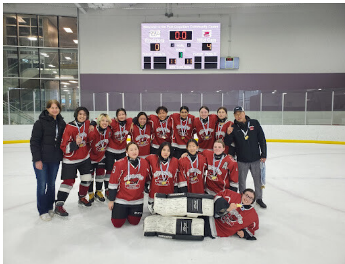
WU18C1 wins GOLD!